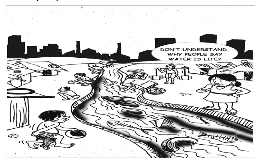
Q4. Develop a short story with the help of the given visual / starting line .Give a suitable title to your story . (150-200 words) 10 marks

India is a highly populated country . People lack in maintaining proper sanitation and hygiene as a result they suffer from various diseases . India has a serious sanitation challenge; around 60 per cent of the world's open defecation takes place in India. Poor sanitation causes health hazards including diarrheoa, particularly in children under 5 years of age, malnutrition and deficiencies in physical development and cognitive ability. You are Nitish /Nikita, head boy/girl of Anand Public School, Jaipur. Write a letter to the editor of a national daily, highlighting the problem and suggesting practical ways to ensure public sanitation and the right to dignity and privacy . (100-120 words, 8 marks )